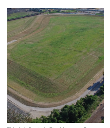
This Ash Basin At The Meramec Energy Center Closed In The Spring Of 2018.

The ash will be compacted, graded and sloped to permanently shed water. After that, an engineered capping system, far stronger than regulations require, will be constructed over the top of the basins and the river-side embankment walls armored with rock. This system will take approximately two years to construct and isolates the ash from infiltration. Precipitation will be routed to newly-constructed storm water