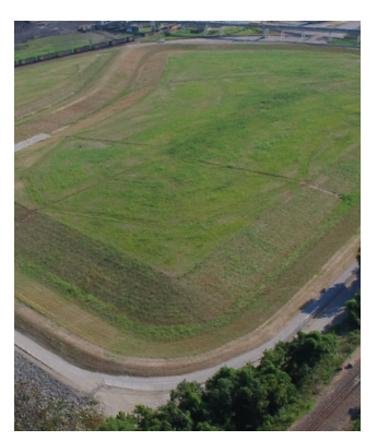
This Ash Basin At The Meramec Energy Center Closed In The Spring Of 2018.

The ash will be compacted, graded and sloped to permanently shed water. After that, an engineered capping system, far stronger than regulations require, will be constructed over the top of the basins and the river-side embankment walls armored with rock. This system will take approximately two years to construct and isolates the ash from infiltration. Precipitation will be routed to newly-constructed storm water