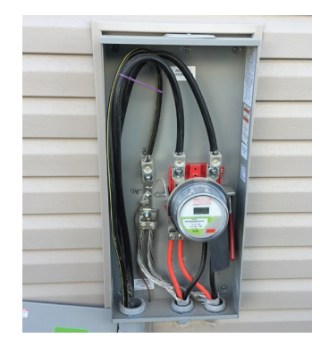
400 Amp With Lever Bypass