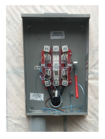
200 Amp With Lever Bypass