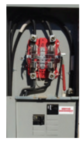
200 Amp With Lever Bypass and Main Disconnect