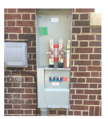
400 Amp With Lever Bypass and Main Disconnect